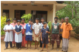
SOME OF THE INMATES - MENTALLY DISABLED

YOU TOO CAN GIVE HOPE, LIFE AND FUTURE TO OUR DIFFERENTLY-ABLED WAR VICTIMS.